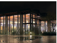
Hubland-Campus by night

Nonsmooth optimization is a highly active field of research in the subject of applied and numerical mathematics. It requires sound knowledge of convex and nonsmooth analysis for the derivation and convergence analysis of modern methods to solve difficult and often nondifferentiable optimization problems. With Amir Beck (Israel), Christian Clason, Anton Schiela, Alexandra Schwartz (Germany) and Tuomo Valkonen (England) we were able to acquire five internationally renowned researchers as speakers. The lectures cover the range from theoretical foundations to the derivation and convergence analysis of optimization methods as well as their numerical realization and application. First, these topics will be explored for finite-dimensional optimization problems. Afterwards, the appropriate ideas and techniques will be transferred to infinite-dimensional problems.