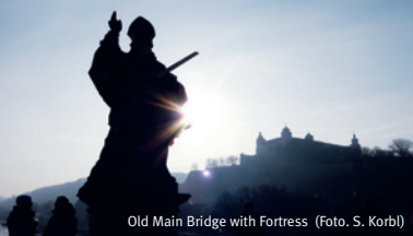
Old Main Bridge with Fortress