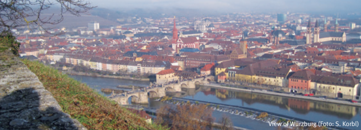
View of Würzburg