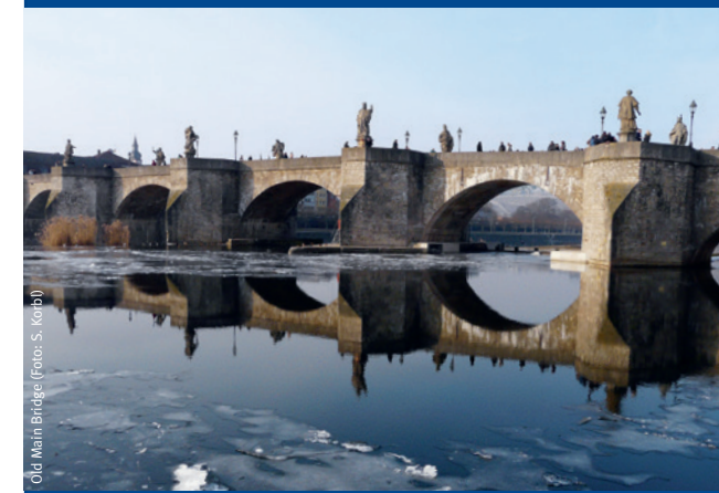
Old Main Bridge