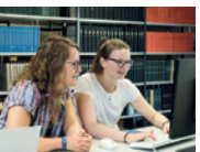
Hubland-Campus / Mathematics Library