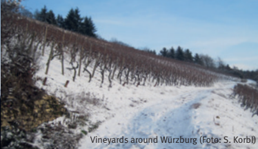
Vineyards around Würzburg