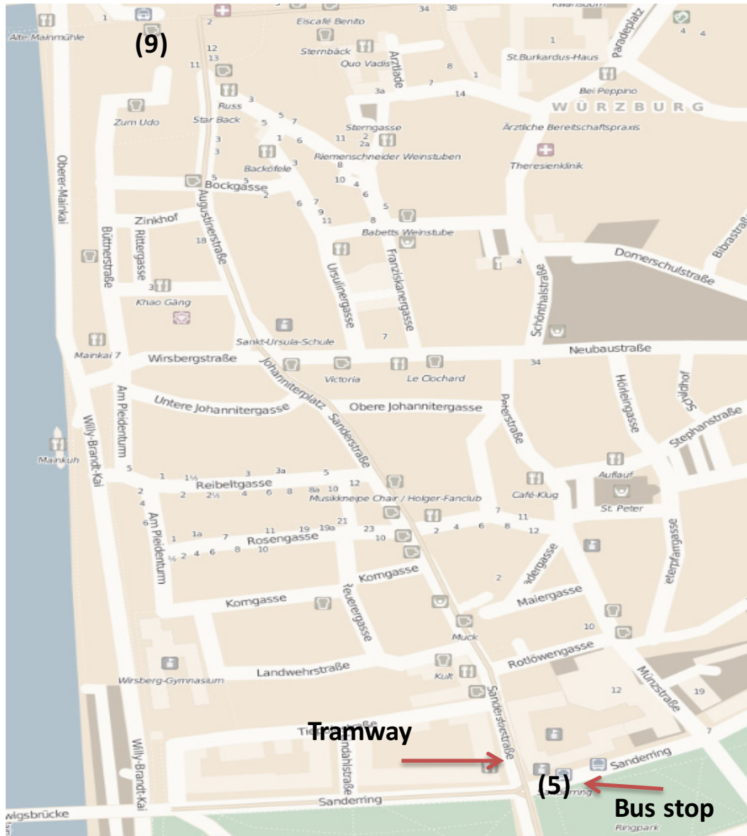
Map: Sanderring and City Center